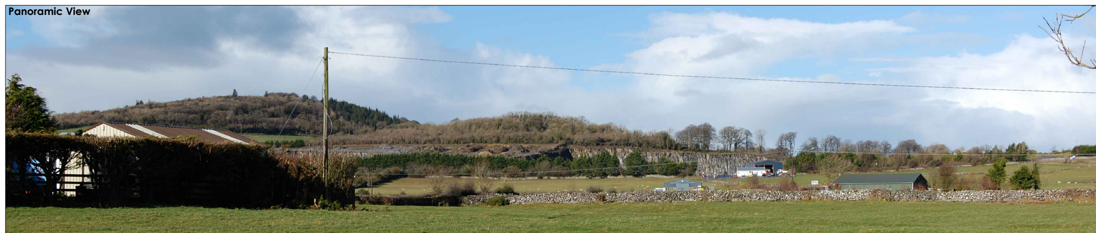
Viewpoint 2 Northwest from Ballaghbaun, Belclare.

View Northwest from minor road in Ballaghbaun, across farmland between groups of residential properties aligning the road. Knockmaa Hill is a visual focal point, however the existing quarry operations (particularly the Northern faces of Mortimers Quarry) are clearly visible. The boundaries of both quarries are marked by the distinct band of Leylandii hedge. There are no views relating to the unauthorised development works.